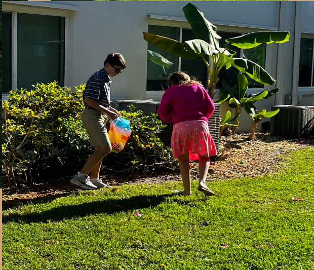
Palm Sunday Easter Egg Hunt