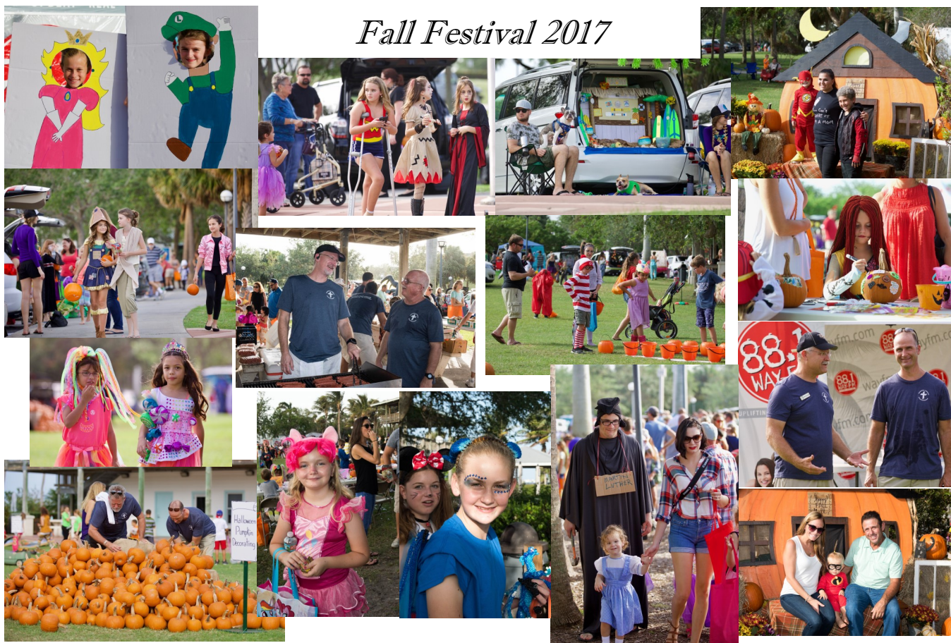
Fall Festival 2017

*New this year: Dress rehearsal will be changed to Saturday at 4:00 p.m.